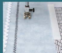
Trim and decorate edges with precision