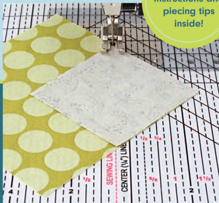
Stitch triangle square blocks with ease