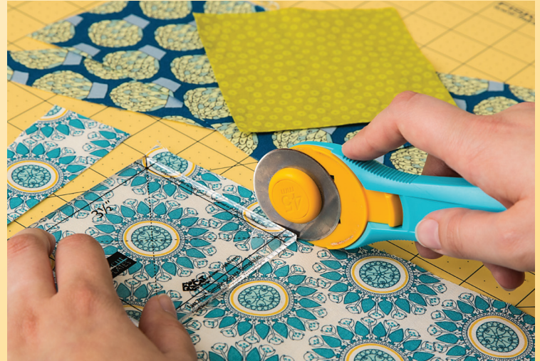
Quickly Cut 3½", 4½" & 5½" Squares